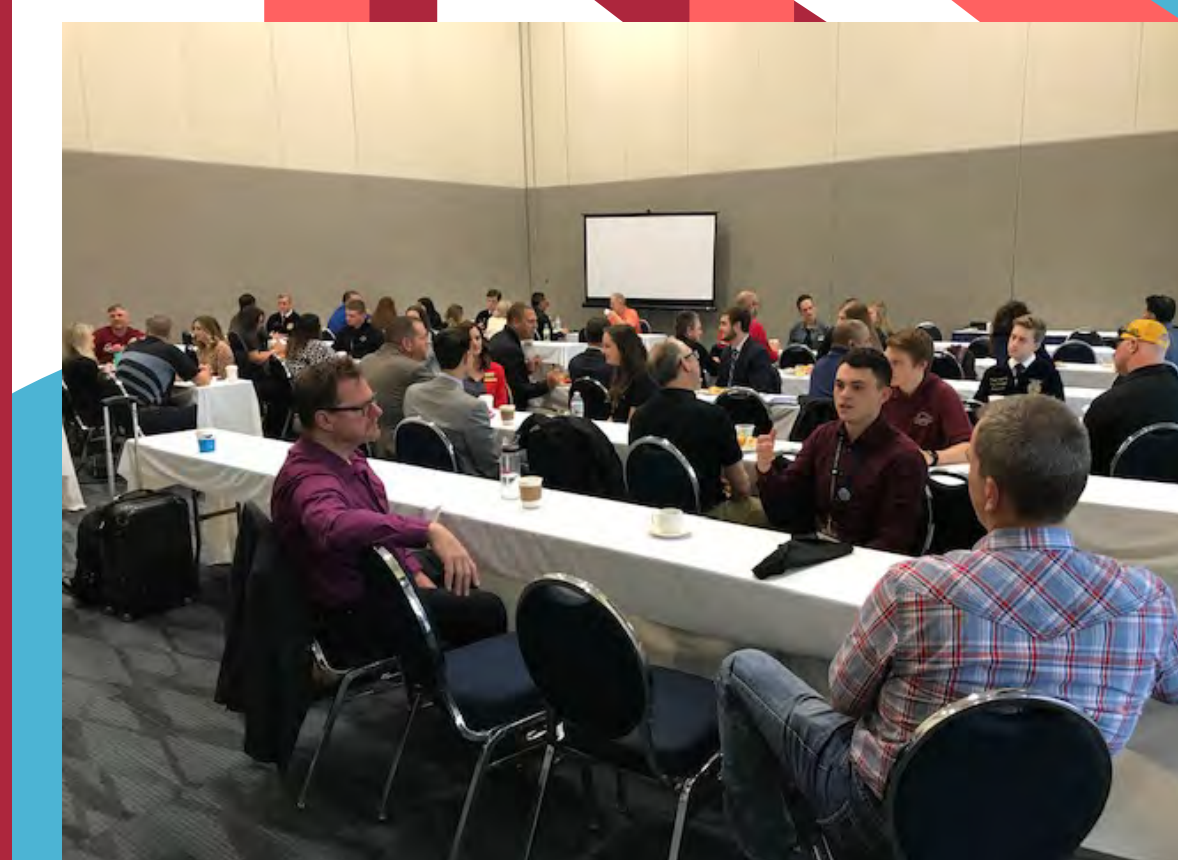
Conference participants had the opportunity to visit with FFA alumni and new teachers during the two-day event in both formal sessions and more relaxed networking settings.

Although the program director offered to cover hotel rooms for participants, no one took advantage of the offer.