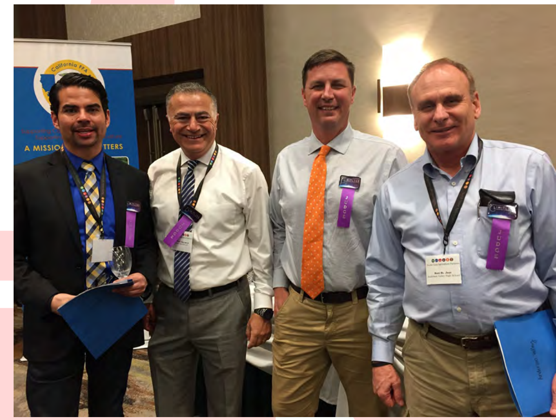
Participants found relevancy in judging student proficiency award interviews (left) and also had the opportunity to attend FFA State Conference Sessions (right).

Evaluation: Evaluation was performed in the form of an email survey soliciting feedback from participants.