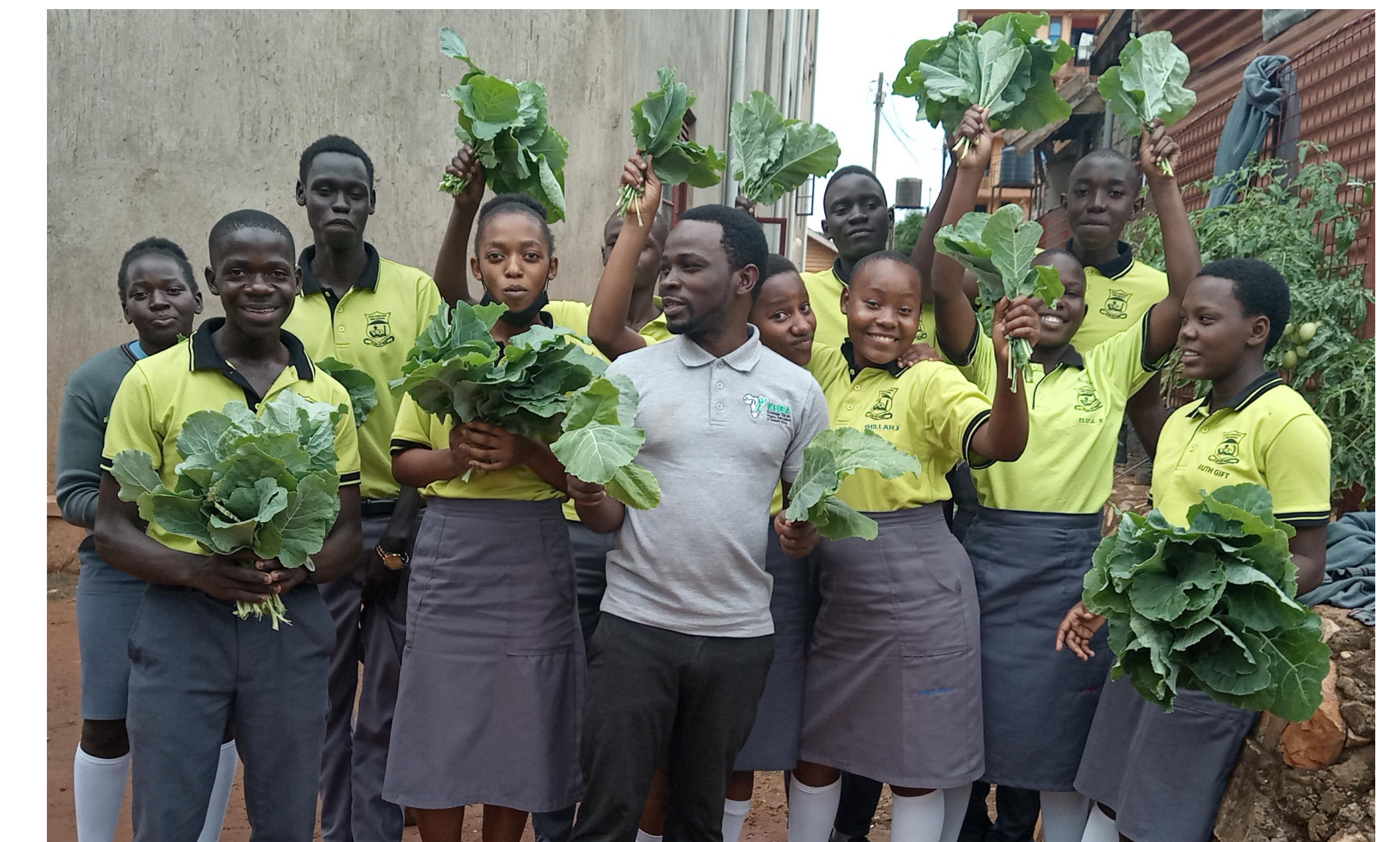
Zana Christian High School YoFFA chapter members pose with their teacher after harvesting their produce.

YoFFA obtained in-kind funding for the School Garden Program from Victoria Seeds (U) Limited and Holistic eLearning Platform (HeLP). Victoria Seeds provided schools with seeds and gardening tools worth $2000 while HeLP hosted the four virtual teacher professional development workshops via Zoom, this costed $300.