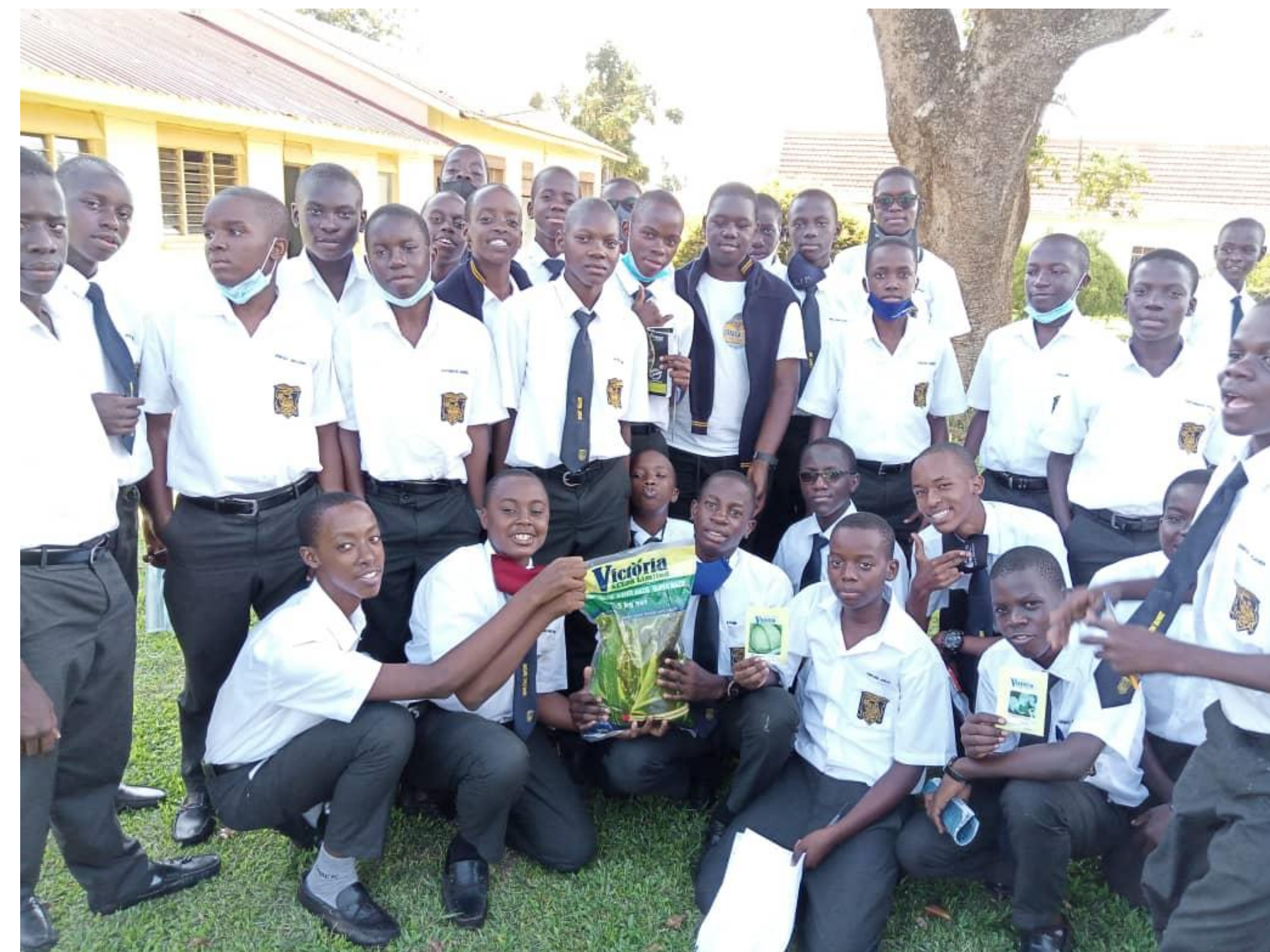
Students at St. Mary's College Kisubi (SMACK) pose with vegetable seeds for their gardening project.