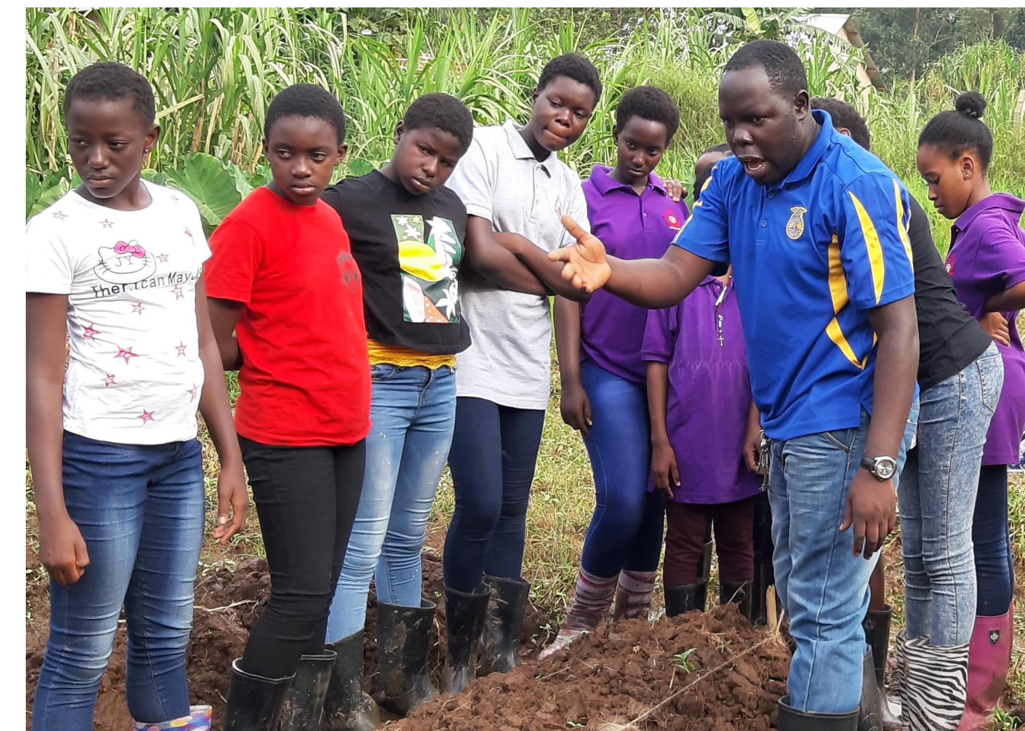
A demonstration for the preparation of a raised seedbed

In 2023, we plan to establish 100 new school gardens while maintaining those gardens created in 2022. Establish collaborations between YoFFA chapters and local FFA chapters in the United States, conducting more professional development workshops, developing school gardening resources, and mobilizing our school chapters to participate in in-school youth focused leadership and career development events.