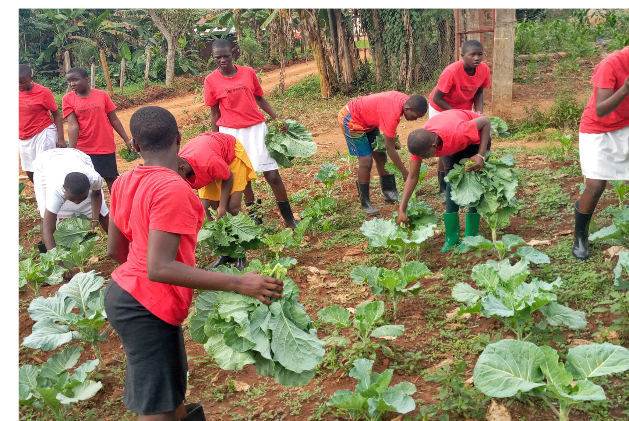
Iganga Girls' Secondary School students' harvesting their kale produce.