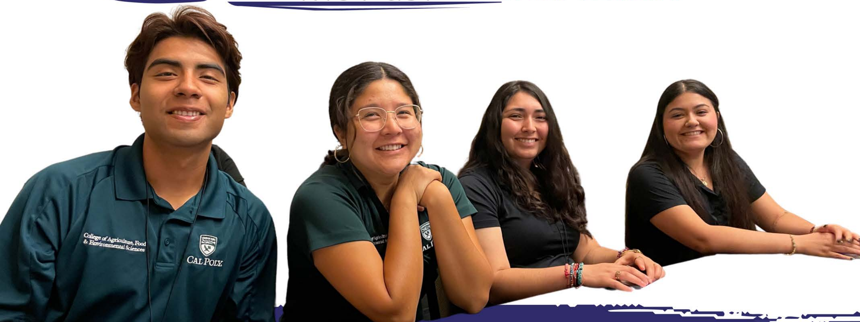
Cal Poly students at a research session during the 2024 AAEE National Conference