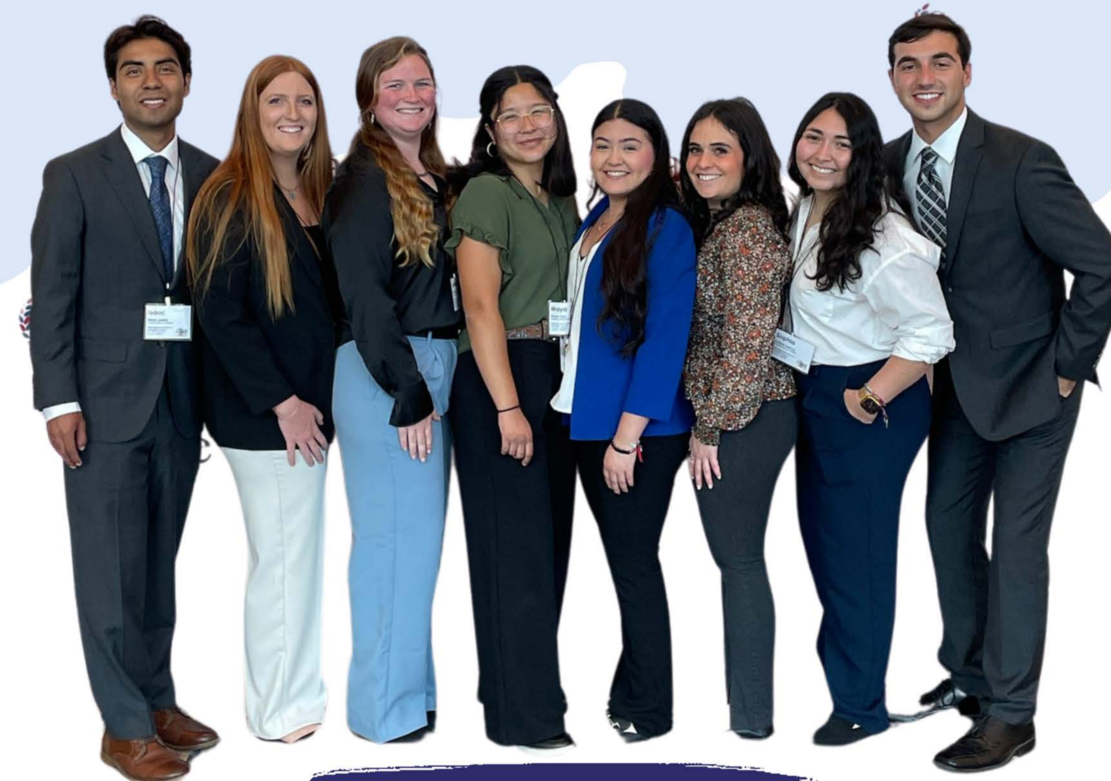
Cal Poly students at the 2024 AAEE National Conference

5 Faculty Engaged 11 Undergraduates Engaged 2 Journal Articles Submitted 16 Conference Posters Submitted