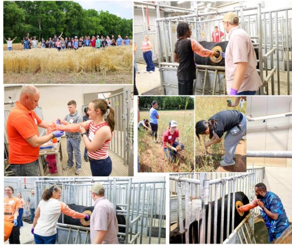
Day 2- Collection of Cow & Wheat Microbiomes.