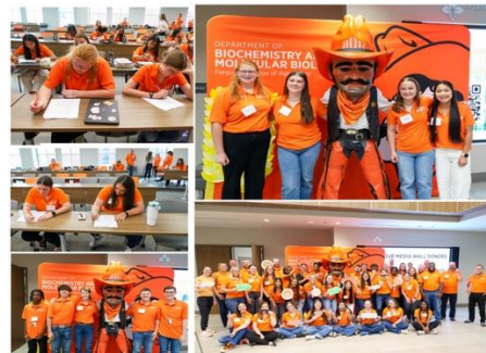
Day 6- Post camp assessment & Presentations.