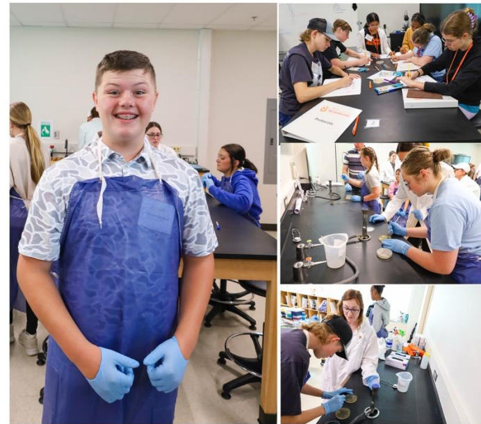
Day 3- Streaking of microbial plates.