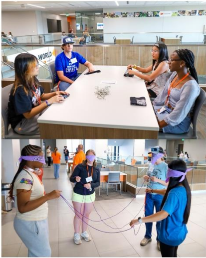
Day 1- Introduction & Familiarization.