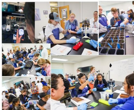
Day 5- Practicing with pipettes and Microscopes.